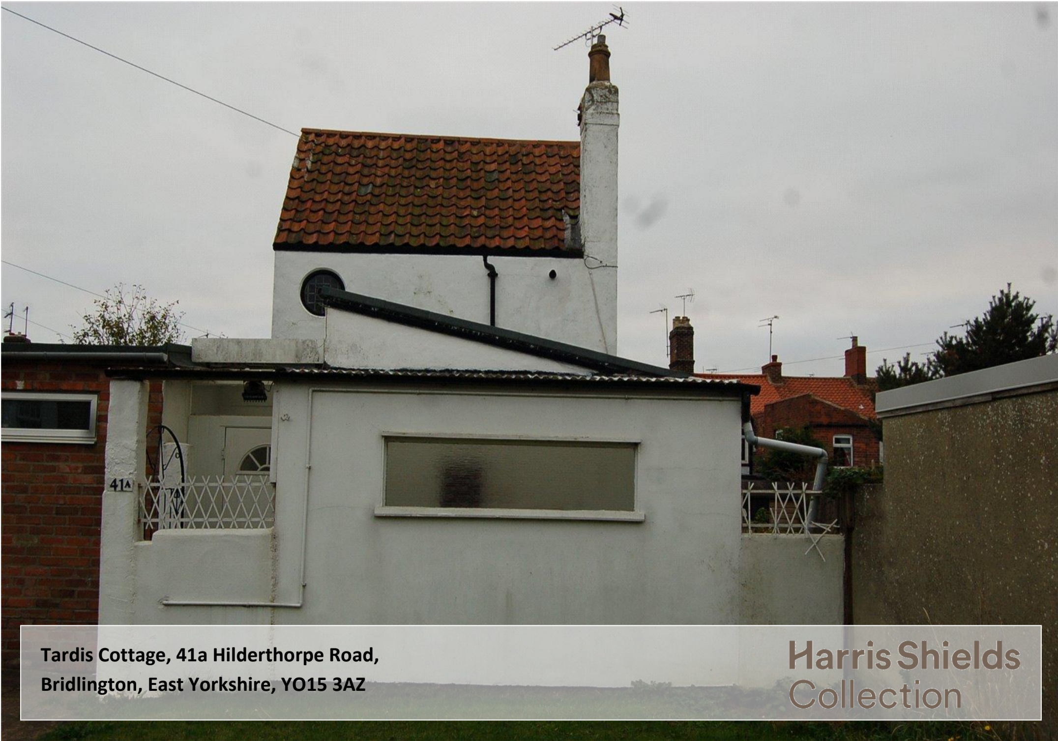
Tardis Cottage, 41a Hilderthorpe Road, Bridlington, East Yorkshire, YO15 3AZ